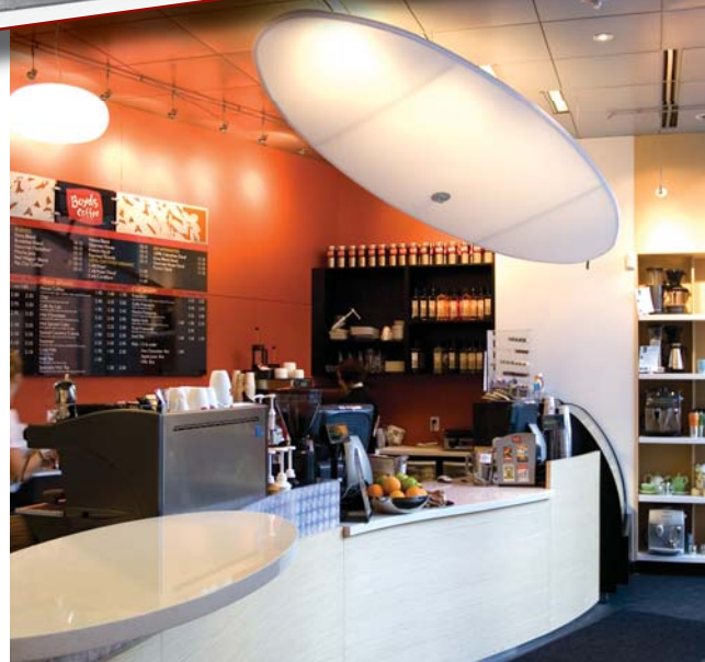
2007 At right, Boyd Coffee Company's newest store in Eliot Tower