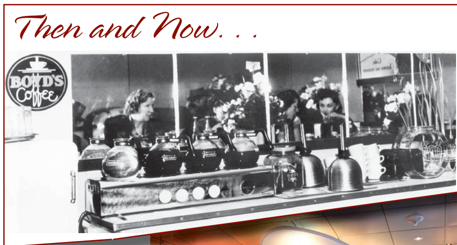
1946 Customers relaxing at a lunch counter